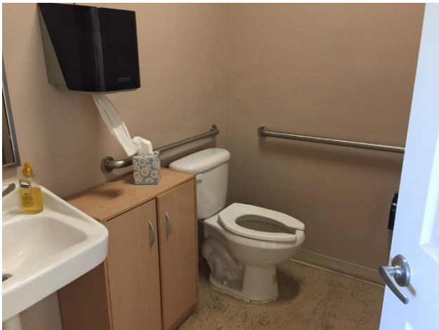
Human potty area.

There will be an aisle along the wall to the right leading to the dog potty area, shown in photo below. There is more potty area accessed through the facility's front door.